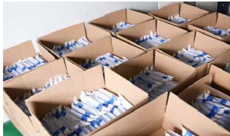
Inspection Record for pouch sealing