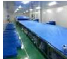
3.1 Fabric Cutting